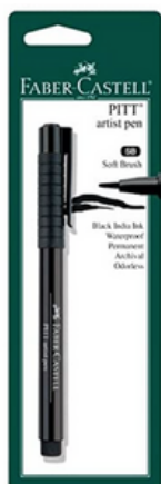
FABER CASTELL Pitt Artist Pen .5-5mm